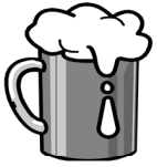
12 oz beer