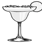
1.5 shot or mixed drink